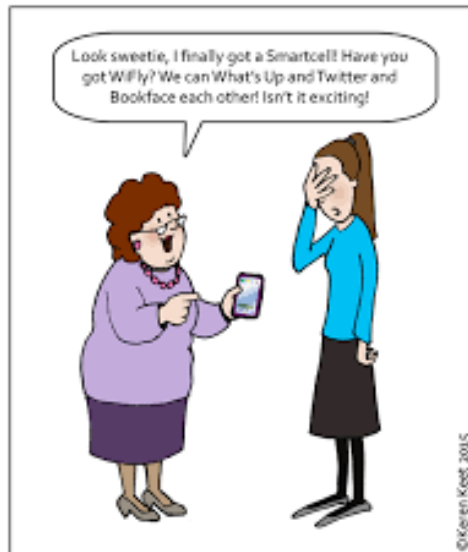
Bubbies and technology